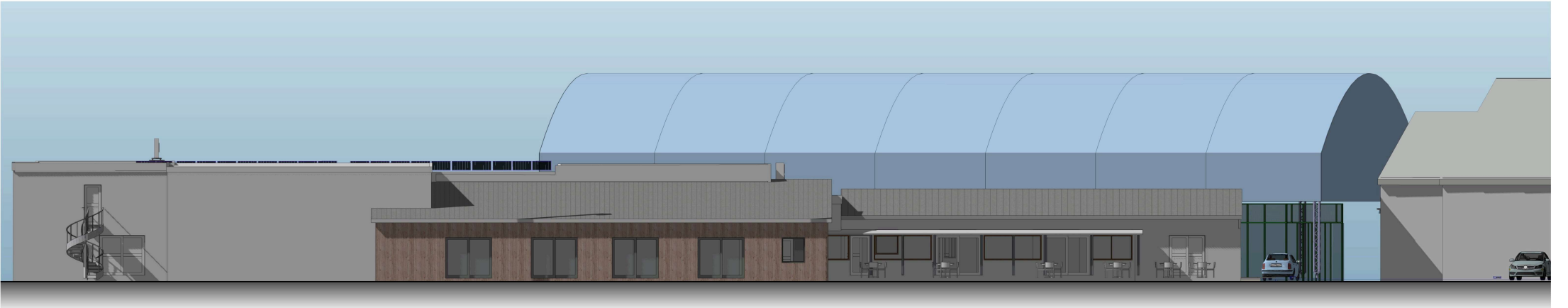
Existing Clubhouse (Squash Courts)