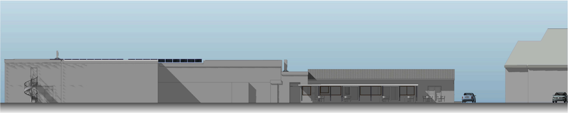
Existing Clubhouse (Squash Courts)